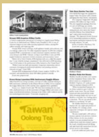
1/6 page Horizontal 112 x 64 mm.