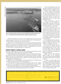
1/8 page Horizontal 178 x 35 mm.