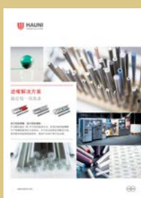
Full page Bleed 216 X 283 mm.