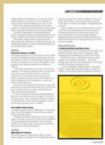
1/4 page Vertical 86 x 124 mm.