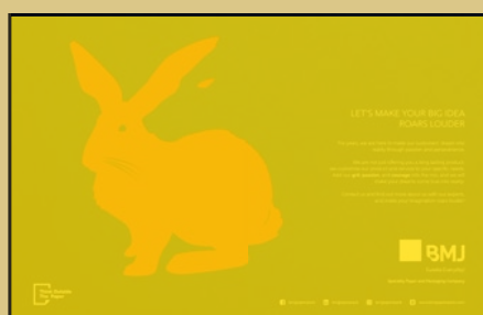
2 page Spread (full bleed) 426 x 283 mm.