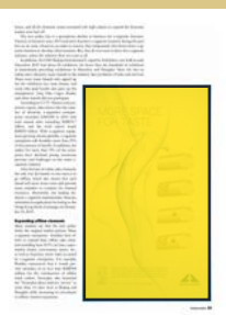
Island half page 115 x 191 mm.