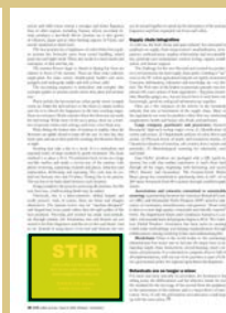
1/8 page Vertical 86 x 61 mm.