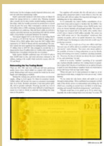
1/3 page Horizontal 178 x 83 mm.