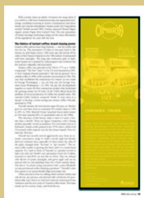
Half page Vertical 89 x 254 mm.