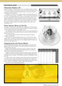
1/4 page Horizontal 178 x 61 mm.