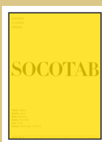
Full page non bleed 210 X 277 mm.