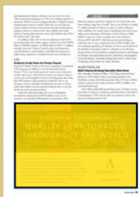
Half page Horizontal 178 x 124 mm.