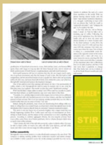
1/6 page Vertical 57 x 124 mm.