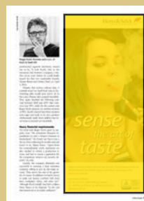
2/3 page 115 x 254 mm.