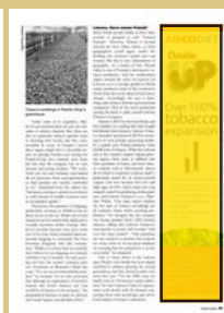
1/3 page Vertical 57 x 254 mm.