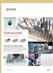
Alternate Chinese/English language advertising (Full page) 216 x 283 mm.